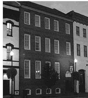
City Tavern Club

Georgetowners — and their role in capturing the history of Georgetown. Due to the fact that The City Tavern Preservation Foundation is hosting this special meeting, we would appreciate an RSVP to cagmail@cagtown.org or 337-7313.